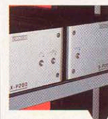
Musical Fidelity X-P200 power amps (x2) £899 each

Never known to stick knobs and buttons where they're not wanted, MF has kept this bijou preamp clutter-free. That goes for the sound, too.