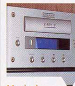
Musical Fidelity X-Ray v3 CD player £899

"The qualification standard for entry to Beautiful Systems is, like origami for beginners, two-fold: beautiful design and beautiful sound."