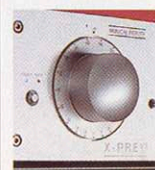
Musical Fidelity X-Pre v3 preamplifier £799

Everything a CD player should be: small, beautifully formed, exciting and unerringly musical.