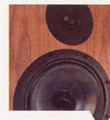
Spondor S8e loudspeaker £1,895 per pair

The natural partner for the X-Pre continues the neat, elegant theme but packs a big wallop all the same, especially in bridged form as here.